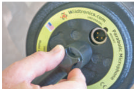
Final tighten knob.