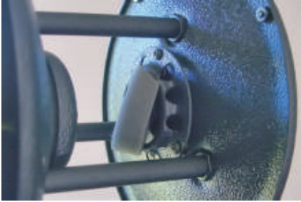
Insert Windscreen into holder.

Once your microphone is inserted and focused, you can install the foam Windscreen. Note, that if you use a typical cardioid microphone, which is not recommended, the microphone end will stick out quite a bit from the plate surface, and may not allow the Windscreen to fit in place. Insert the foam Windscreen into the Windscreen holder as shown. Once you have it started, tuck in the sides of the Windscreen so the entire Windscreen is inside the Windscreen holder as shown. When fully seated, the sides of the Windscreen will make contact with the surface of the plate without air gaps.