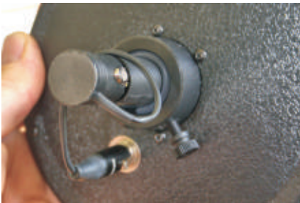
Install front mic cable and wrap.

You may want to make a small mark on your microphone, flush with the back of the Mic Mount so you can quickly remove and reinstall your microphone in the correct position without removing the windscreen. You can now plug in the Front Microphone Cable, to connect your microphone to the front TA3M connector. If you have excess cable, you can spiral wrap the excess around the microphone as shown. This completes your assembly, and your microphone is ready for use. Plug in your XLR mic cable at the rear panel to connect your preamp or recorder.