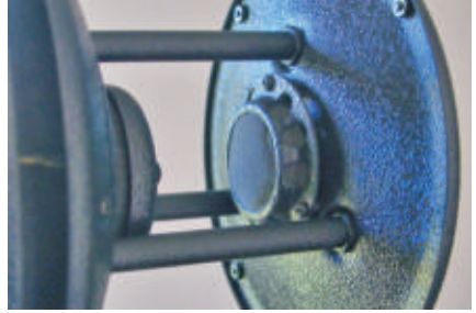
Tuck Windscreen into holder.

You may want to make a small mark on your microphone, flush with the back of the Mic Mount so you can quickly remove and reinstall your microphone in the correct position without removing the windscreen. You can now plug in the Front Microphone Cable, to connect your microphone to the front TA3M connector. If you have excess cable, you can spiral wrap the excess around the microphone as shown. This completes your assembly, and your microphone is ready for use. Plug in your XLR mic cable at the rear panel to connect your preamp or recorder.