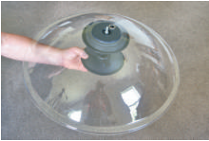
Place dish over Mic Mount.

turns. Be sure not to over tighten this hand knob. If you reach the end stop, loosen by two turns. When tightened correctly, the dish will be able to slightly rotate, by hand, but hold it's position on it's own. The dish is mounted with a foam suspension system to reduce handling noise. If over tightened, this feature will no longer function well. You are now ready to mount your microphone into the Microphone Mount.