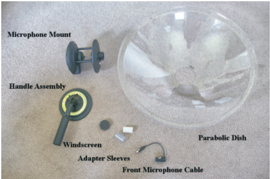
Major components of the Parabolic Microphone

Assembly and disassembly is easy. The Wildtronics Universal Parabolic Microphone is comprised of three major parts: the Parabolic Dish, the Handle Assembly, and the Microphone Mount. Also included are the Windscreen, Adapter Sleeves, and Front Microphone Cable.