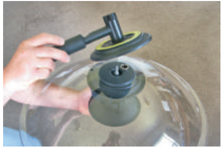
Center Handle onto stud.