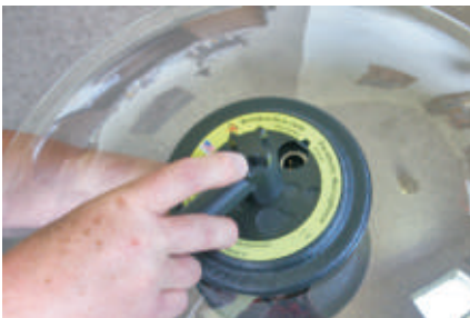
Align and slightly tighten knob.